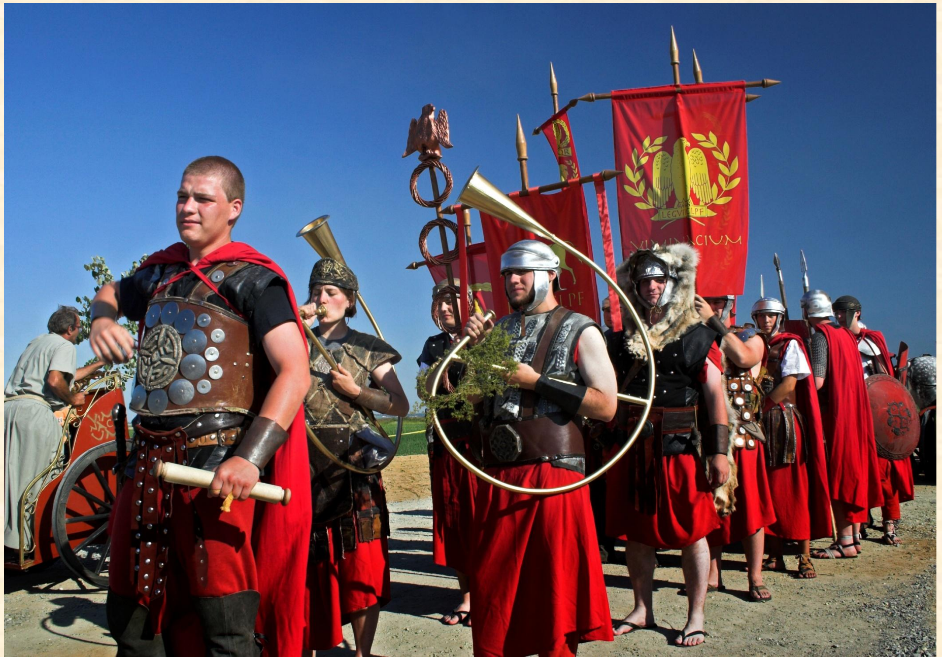
Re-living ancient history!