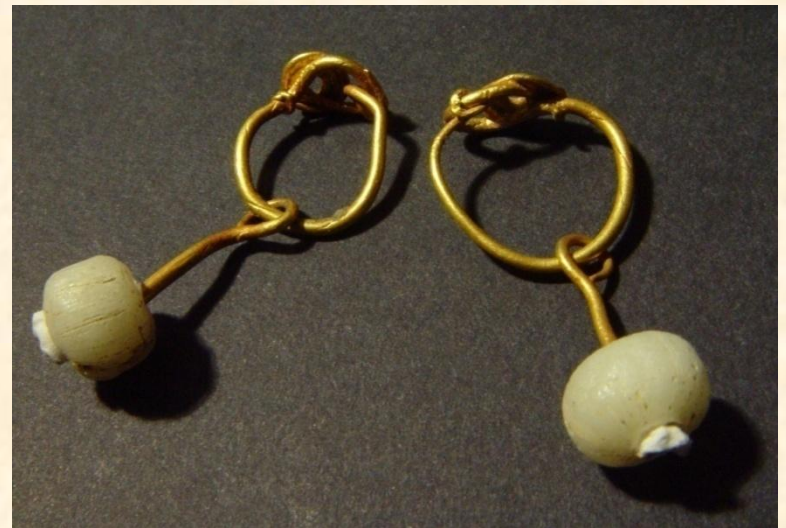
Viminacium cemetery (necropolis) – golden jewelry finds from 2 nd – 3 rd century graves